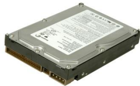
Buys HDD in Kumasi, Ghana